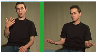
PU (lexical/filler) WELL