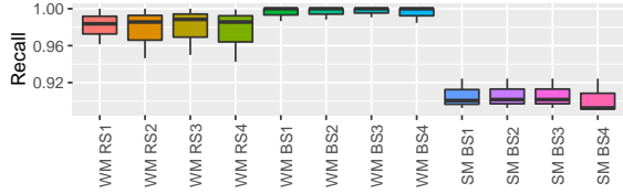
Fig. 2. Recall

the percentage of non-equivalent mutants detected by the BS/RS amongst the selected mutants. By construction, the ALE algorithm has a recall of 100%, it is therefore not shown here. It is also noted that the precision is 100% since all the non-equivalent mutants detected are indeed killable, by construction of our mutant set.