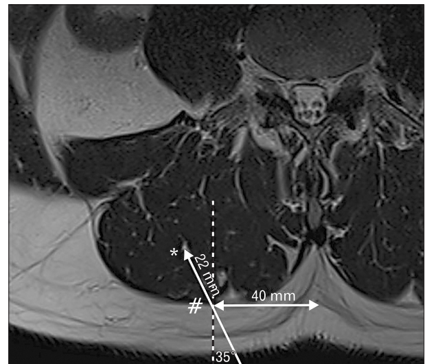
Fig. 2. Biopsy of the right paraspinal muscle. Distance between spinous process and biopsy site, 40 mm; biopsy angle, 35°; normal biopsy depth from fascia (#) into muscle (*), 22 mm.

Magnetic resonance imaging (MRI) showed no deviant findings within the paraspinal musculature. At the level L4–L5 there was slight bulging of the discus superimposed with a small medial hernia, but no impression of the anterior dura. Level L5–S1 showed pronounced degenerative disc disease with pseudo bulging caused by a degree one anterolisthesis (Fig. 3). As a result of anterolisthesis and disc degeneration, caused by a bilateral isthmolysis there was bilateral foraminal stenosis. Both left and right multisegmental degenerative arthritis of the facet joints was present. Because MRI imaging could not provide a solid answer to the origin of the lesion, an