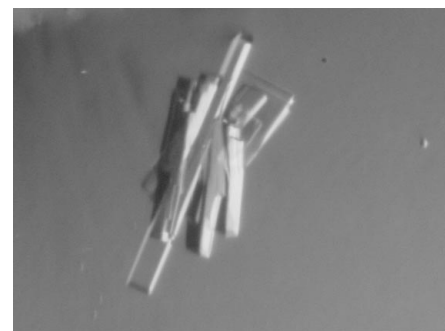
Figure 2 Typical plate crystals of T. maritima TruB obtained by equilibration against a solution of 100 mM citrate pH 3.5, 200 mM Li 2 SO 4 , 20% glycerol, 13% PEG 5000. The maximum dimension of the crystals is about 0.250 mm.

A complete diffraction data set was collected on beamline BM30 at ESRF (Grenoble) on a flash-frozen crystal using a MAR CCD detector at a wavelength of 0.97985 Å. The crystal diffracted to 2.0 Å. The distance between the crystal and the