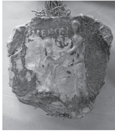
Fig. 10.3—Seal of Cono of Béthune. Lille, Archives Départementales du Nord, 7 G 70/983 (1203).