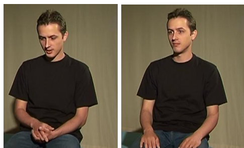
Figure 5: S2:crossed-BoM on the left, S2:body-BoE on the right