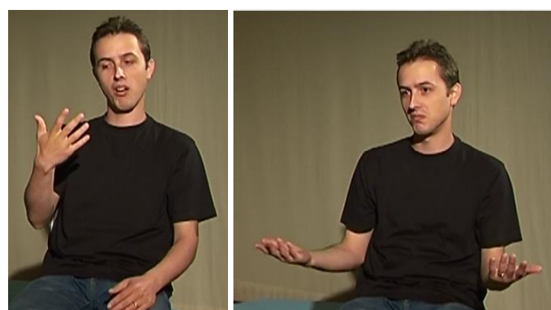
Figure 1: PU-R-Mod on the left, PU-Lex/Fill on the right

Ex. 1 BEFORE FG:E Grid PU-Mod FG:E GIVEN UP GRID GRID CALCULATION GRID PU-Lex/Fill S2:body-BoE Before, the sign for Excel was with the letter E. It is not good. We gave up the letter E and we kept only the sign for grid. Here it is.