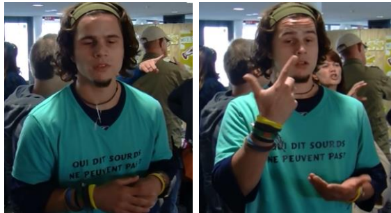
Figure 3: S2:crossed-BoM on the left, PU-L(I)-Lex/Fill on the right

Ex. 3 DEAF PU-L (I)-Mod NOT ENOUGH IN MORE WORLD DEAF Deaf people, Oh! they really are not involved enough in the deaf world.