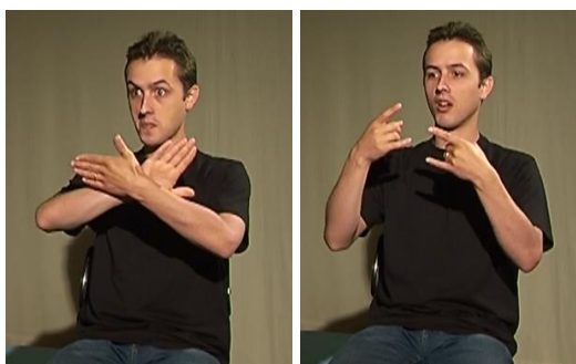
Figure 7: S1:start-Str WHOLE on the left, S1:start-Hes WINDOW on the right

No cases of S1:middel were found in our data.