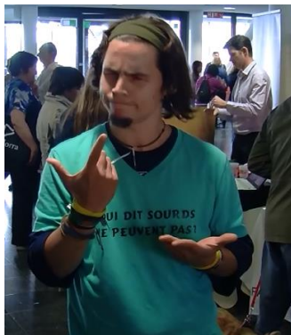
Figure 4: PU-Mod

Ex. 3 DEAF PU-L (I)-Mod NOT ENOUGH IN MORE WORLD DEAF Deaf people, Oh! they really are not involved enough in the deaf world.