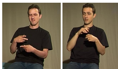
Figure 6: S2:neutral-Mod on the left, S2:neutral-Sus on the right