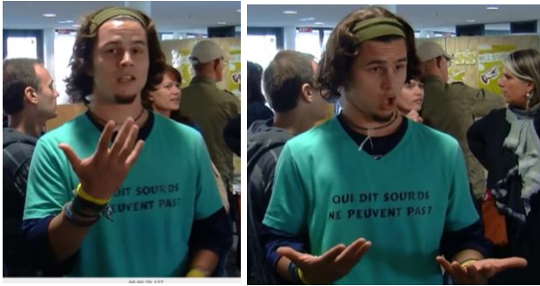
Figure 2: PU-R Lex/Fill (HERE-IT-IS) on the left, PU Lex/Fill (NOW) on the right