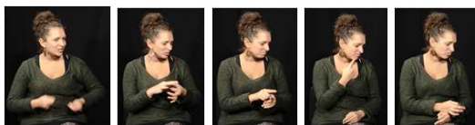
DEPENSER LIEN MEME DIRE OUI "It is linked to consumerism as we said, yes..."

As parenth marker, it is accompanied by other signs that refer to other parts of the discourse as in the example.