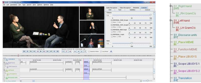
Screenshot of an annotation file