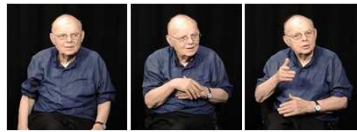
Figure 1. Types of pauses

When prosodic segmentation is finished, display the SyU tier