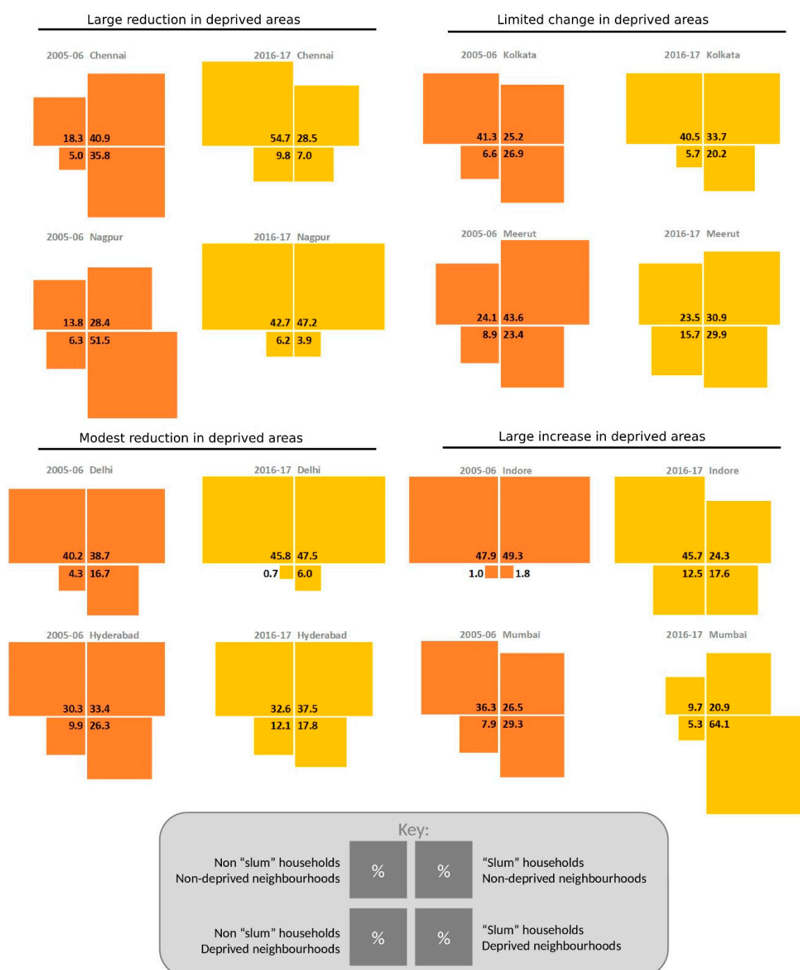
Figure 2. Distribution of population in “slum households” and deprived neighborhoods across eight Indian cities in 2005–2006 and 2016–2017 based on National Family Health Surveys.

The results reveal heterogeneous distributions of populations in “slum households” located in deprived neighborhoods (field-referenced identified slums) versus non-deprived neighborhoods (field-referenced non-slums), as well as changes in these distributions over time. Figure 2 summarizes the percent of population in non-“slum households” in non-deprived neighborhoods (top left), in “slum households” in non-deprived neighborhoods (top right), in non-“slum households” in deprived neighborhoods (bottom left), and in “slum households” in deprived neighborhoods (bottom right). If most “slum households” were located in identified “slums,” as is often assumed, then the top right and bottom left boxes in each diagram would be small or non-existent.