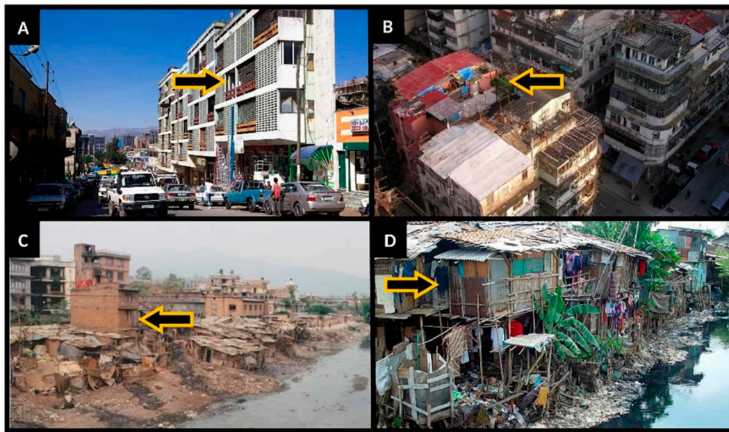
Figure 1. Four ways in which “slum households” and deprived area risk factors intersect. (A) Non-slum household in non-deprived area, (B) Slum household in non-deprived area, (C) Non-slum households in deprived area, and (D) slum households in deprived area.