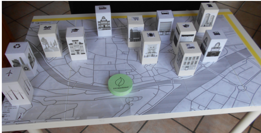
Fig. 4. Example of city model that could be built during the activity. The environment domain view is placed on the city map.