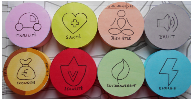
Fig. 2. Prototype of the domain view markers (English translation from left to right: mobility, health, well-being, noise, economy, safety, environment, energy)