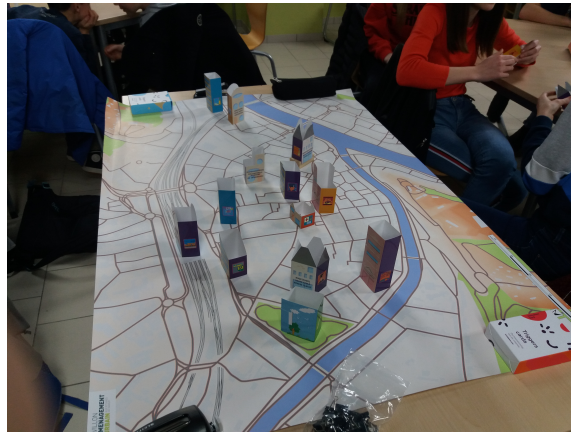
Fig. 1. Example of a city model built by children during one session of the activity (reproduced from [22])

The evaluation of this activity showed success in improving children's understanding of the concept as well as interest for participation and mature discussions around it [22]. However, one major issue that arose is the lack of depth of the debates around the city model, which is limited by its low interactivity. Indeed, when placing a building on the model, no information on the impact of the building is rendered, which makes it difficult for children to ground their discussions. Instead, the debates were driven by children's personal preferences or by high-level questions such as the overall concentration of buildings. We aim at addressing this issue by proposing a collaborative tangible interface to support the city model construction as an alternative to the current paper-based approach. This article presents the preliminary results of the research efforts undertaken in this direction.