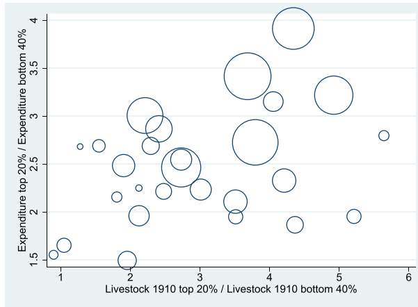
Fig. 2. Pseudo-Kuznets Ratios for Expenditures 2011–13 and for Livestock in the 1910s (Dots Proportional to Tribe Size).

surnames, the estimated persistence rate in social status across generations is slightly higher (between 0.7 and 0.9). However, in the rest of the literature, persistence rates are much lower and vary strongly over space and time (Solon, 2018). For example, using surnames data from the United States, Chetty et al. (2014) find a persistence rate of about 0.4. Our estimated degree of persistence in tribes' relative well-being is therefore surprisingly large, given the political and economic turmoil experienced by Kyrgyz people over the twentieth century.