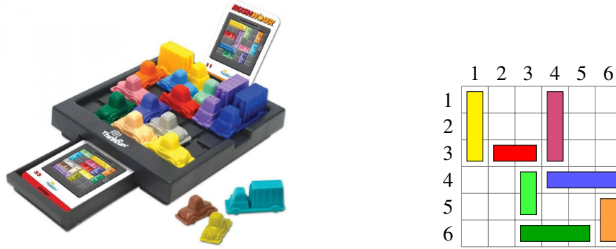
Figure 1: Rush Hour Problem. On the left part, the game as illustrated at https://www.michaelfogleman.com/rush . On the right part, the game modeled as a grid of 6 \times 6 , with cars and trucks depicted as rectangles of different colors.

checking temporal logic formulae and by producing traces that can be replayed as evidences of the establishment of the formulae. However, as well-known in model checking, this goal raises performance issues related to the state space explosion. In particular, letting animation-related primitives interleave in many ways duplicates research paths during model checking, with considerable performance problems to check that formulae are established. To address this problem, we introduce in this paper a guarded list construct and establish that it yields an increase in performance while strictly enriching the expressiveness of Bach.